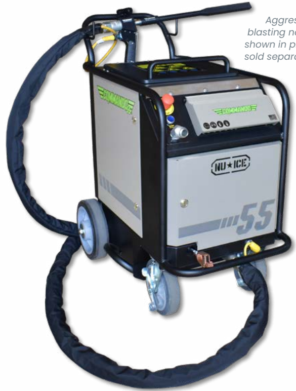
Aggressive blasting nozzle shown in photo sold separately

The COMMANDO ® 55 Dry Ice Blaster is a powerful pneumatic and electric cleaning machine built to take on even the most challenging cleaning applications. Ideal for heavy duty cleaning and commercial cleaning service applications, the COMMANDO ® 55 features a larger 55 lbs (25 kg) hopper, the BlitzFeed ® freezeless dry ice delivery system and an increased air flow capacity for maximum blasting velocity.